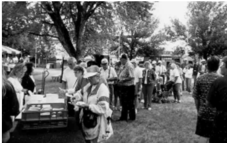
People lined the street for the $1 lunch at Pride of Dakota Day.

The activity-packed event was a hit as over one thousand people visited the tent to eat and shop. As in the past, Pride of Dakota companies were able to sell their products from 11 a.m. to 5 p.m. This year 35 Pride of Dakota companies participated! A lunch for $1 was sponsored by Cloverdale, Pan-O-Gold Baking, Land-O-Lakes and Dakota Pasta Growers. All proceeds were donated to the Ag in the Classroom program.