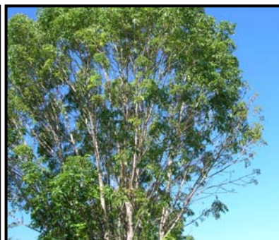
Thinning crown due to psyllid feeding