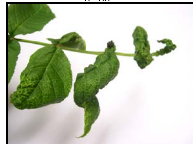
Injury caused by psyllid feeding