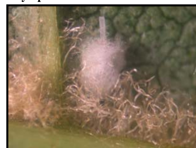
Nymph covered by wax