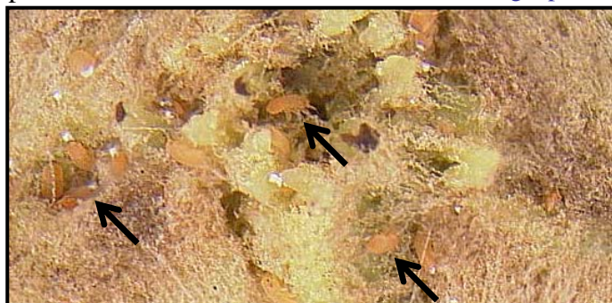
Nymphs feeding on a bud as it opens