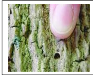
Fig. 3 - Exit Hole