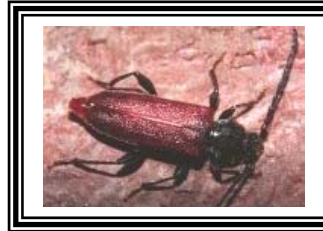
Cedar Longhorned Beetle