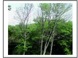
Fig. 4 - Infested Ash Trees

Adults are larger and a brighter green than any of the native North American species of Agrilus (Figure 1). Larvae reach a length of 32 mm, are cream-colored and dorso-ventrally flattened (Figure 2). The Emerald Ash Borer appears to have a one year life cycle in southern Michigan but could require two years to complete a generation in colder regions. Adult emergence begins in mid to late May, peaks in early to mid June, and continues into late June. The adults are active during the day, particularly when conditions are warm and sunny. Most beetles remain in protected locations in bark crevices or on foliage during rain, heavy cloud cover, high winds or temperatures above 32C (90F). Chinese literature indicates that beetles usually fly within 2 meters of the ground.