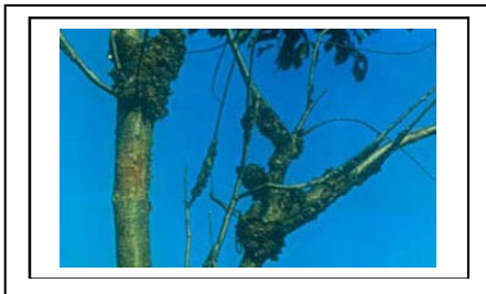
Black knot on Prunus

Larvae of the lesser peach tree borer are cambial feeders, and can girdle the stem. Larvae feed only on living tissue, and do not bore into the wood. In addition to chokecherry, other known hosts include peach, plum and cherry.