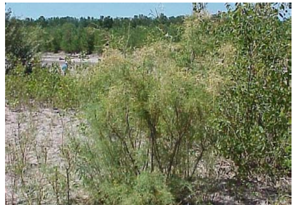
Saltcedar on Yellowstone River in North Dakota