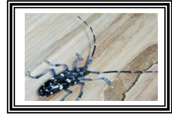
Citrus Longhorned beetle