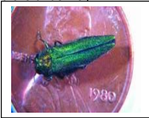
Fig. 1 - Adult

A new exotic beetle from Asia was discovered feeding on ash ( Fraxinus spp. ) trees in southeastern Michigan. It was identified in July 2002 as Agrilus planipennis Fairmaire (Coleoptera: Buprestidae). Larvae feed in the phloem and outer sapwood, producing galleries that eventually girdle and kill branches and entire trees. Evidence suggests that A. planipennis has been established in Michigan for at least five years. Surveys to determine the extent of the infested area are underway.