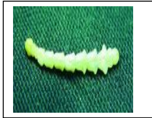
Fig. 2 - Larva