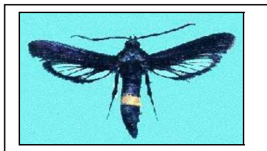
Lesser Peach Tree Borer

Black knot and lesser peach tree borer may become problems for nursery growers and can result in uncertifiable stock. Control recommendations for blackknot can be found in NDSU Extension circular PP-689.