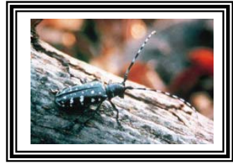
Asian Longhorned Beetle