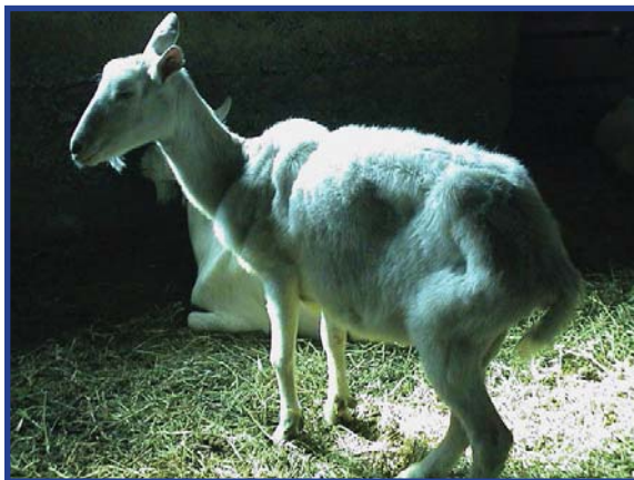
A goat showing symptoms of Johne's disease.

A: A goat that appears perfectly healthy can be infected with MAP . Although goats become infected in the first few months of life, many remain free of clinical illness until months or years later. When goats finally do become ill, the symptoms are vague and similar to other ailments: rapid weight loss and, in some cases, diarrhea. Despite continuing to eat well, infected goats soon become emaciated and weak.